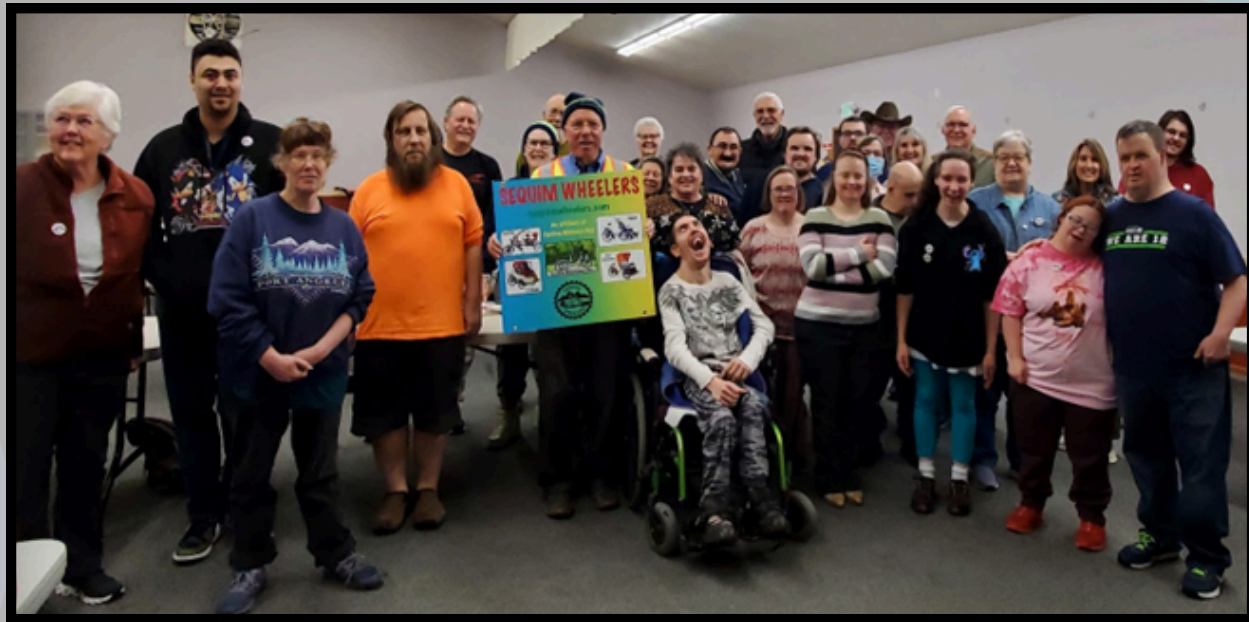
The Friends Together and Sequim Wheelers pre-season meeting