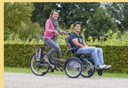
VeloPlus Wheelchair bike to come soon!

The Sequim Wheelers received the largest single donation of $10,000 from an individual. In March; the Board voted unanimously to use the donation for the purchase of a new Chat Rickshaw bike. This bike is manufactured by Van Raam in the Netherlands and is set to be delivered mid-July!