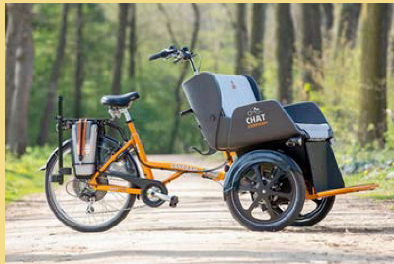
Two- seated Chat Rickshaw bicycle

In mid-July, 4 new bikes will be added to our fleet the Chat Rickshaw and 2 Opairs