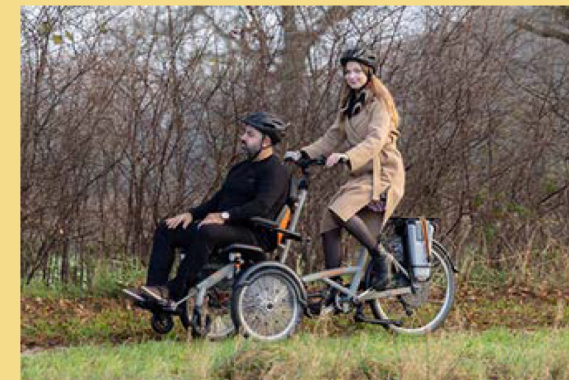
2 Opair bicycles

Next, our hostess, Nancy Hutt, offered to vacate the east side of the milk shed so we could have the WHOLE building! The Board and the Maintenance crew helped move her stuff out of the shed and into the barn. Since then, Grant Rollins, with Jeff & Jean Gurnee, cleaned it out and installed new lights and electrical outlets. Grant is now working on making a double door, so that we will have a wide enough opening to roll bikes through! The East room is 12' x 20', so we can store 2 or 3 bikes, and still have room to work on them out of the rain. Grant and Jeff also installed power and lights in Nancy's barn to help her out.